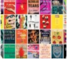
The Great Second-Half 2021 Book Preview