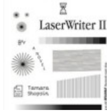
PW Picks: Books of the Week