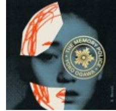
10 Strangest Sci-Fi Dystopias