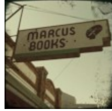
Black-Owned Bookstores to Support Now